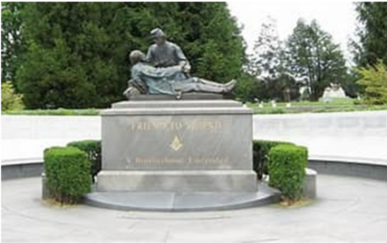
Friend to Friend Masonic Memorial Dedicated August 21st, 1995

There is more in parting of the ways as in death of family, friends and leaving behind the mortal, but grasping the memories of lives past. We as Masons prepare for the inevitable, we do not welcome it, but we prepare for it, and throughout life we are reminded to be prepared. As we part ways from this life, we look for the promise of anew, and possibly the rejoining of those we have parted from. Forever to "Meet upon the Level and Part upon the Square".